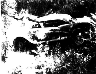
AUTO BURNS An auto driver unknown, burned about 1:30 p. m. Saturday on US 21 near Betty Acres, near Brentwood. The auto with three persons in it was on the road when the fire gained headway the auto was pushed off the road into a ditch. The car had Taylor, home phone plate.