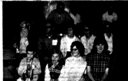
PROJECT WINNERS - The winners of various 4-H Club projects posed following 4-H Achievement exercises last week at Livingston school. The members and their projects are listed during the second week in October to begin their semi-annual surveillance of Kentucky's forests.

The club received top honors for its participation in county 4-H activities including the completion of several 4-H projects, talent show, Christmas activities, 4-H Club picnic, starting Party, horse back riding, radio broadcasting, croquet, project presentation, county Dairy Day activities, 4-H cook-out, a birthday party for each member, and participation in 4-H Achievement Day. Second place went to the Wildlife Community Club, and third place to the Mt. Vernon Community Club.