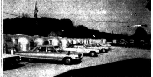
TRAILERS GALORE - Mobile homes to the right and to the left of the Mountain Valley Camp were in evidence over the week and at the Caravan Club of Michigan and Canada, and elsewhere, surveyed on Mountain Valley to see the Barrenness, visit Ballou's Cove and party on Halloween. There were about 80 trailers in the valley. The group reported enjoying the week end despite the cool weather, and said they would pay the Valley a yearly visit.