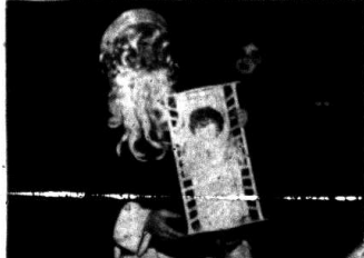
SANTA CLAUS AND LITTLE FRIENDS -- They Come From Everywhere --