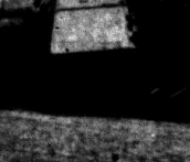
As in previous years, shorn wool payments will be equal to a percentage of each producer's cash returns from sales.

Incentive price for shorn wool for the 1968 marketing year will be 85 cents a pound, up three cents a pound from the present level.