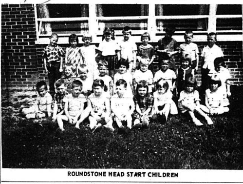
ROUNDSTONE HEAD START CHILDREN

Gov. Edward Breathitt laid his power and prestige on the line this week for the Renfro Valley Dam and Lake project.