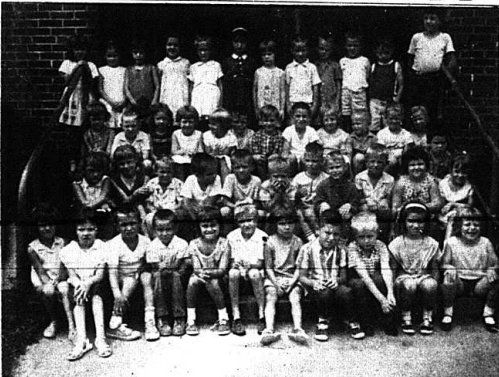
HEAD START YOUNGSTERS AT BRODHEAD