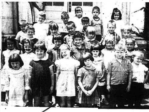
HEAD START GROUP POSES AT LIVINGSTON