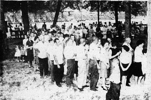
HEADING FOR FISH- Members and guests of the Cumberland Production Credit Association turned out in full force Tuesday night at the Broadhead Fairgrounds for the CPCA annual fish fry and business meeting. Above is part of the line converging on fish, cole slaw, potato chips and soda pop.