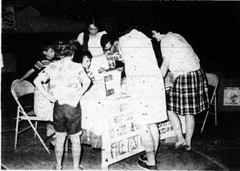
AT THE HEALTH FAIR—It was a successful Health Fair last week at Mt. Vernon School, when, despite a Friday rain, some 300 persons attended. Among the visitors were children of the Head Start program along with 80 of their parents. The fair contained various exhibits and proved interesting. In the above picture, a group is shown around a display on diabetes. 160 persons got diabetes tests.