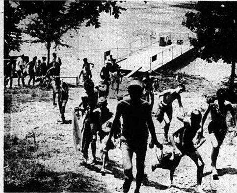
RECREATION is a more traditional part of a young boy's life at the Trooper Island camp. This group has just returned from an exploratory tour of Dale Hollow Reservoir on the 40-foot floatboat in the background. Other activities include swimming, hiking and badminton. All activities are supervised by State Policemen, serving as camp counselors. Currently limited to 35 boys a week, the camp will eventually accommodate 120 boys at a time.