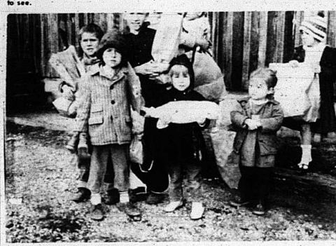
HAPPY CHILDREN. —Despite the puzzled looks, the above children were happy with their gifts as they waited for a ride home after the Christmas Party at Renfro Valley. Some of the above group got clothing as well as toys.