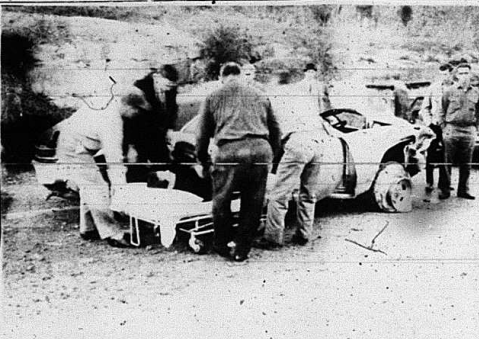
HURT IN WRECK. —Five members of an Illinois family, unidentified, were involved in an auto accident Sunday afternoon near Belly Acres Restaurant at Penfro Valley. The driver lost control of the car when it hit gravel on the shoulder of the road. The car then crossed the road and struck the embankment. Above, the driver is being placed on a stretcher. No one was believed to be injured seriously.