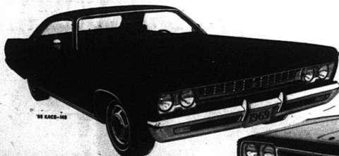
PLYMOUTH SPORT FURY 2-DOOR HARDTOP