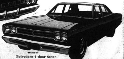
Belvedere 4-door Sedan