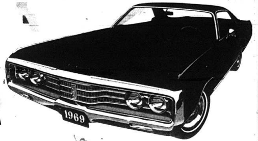
New Yorker 2-Dr. Hardtop