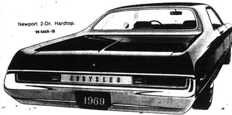
Newport 2-Dr. Hardtop. 68 SAES-73

See The 1969 Chryslers Plymouths Dodges now!