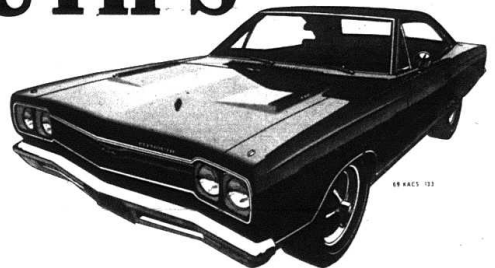
PLYMOUTH GTX 2-DOOR HARDTOP