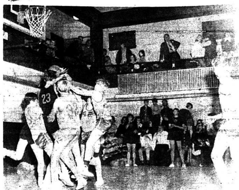
Do you want to see good grade school basketball -- such as pictured in the above photo? Well, all you have to do is attend the Friday and Saturday night sessions of the Rockcastle County Jaycees Tournament, Friday night, Somerset will meet Crab Orchard and Mt. Vernon will go against Brothead. Saturday night will be the consolation and championship games. In action Tuesday night, Somerset soundly trounced Roundstone 69-20 and Brothead won over Livingston 37-30. The above photo was taken during that game.