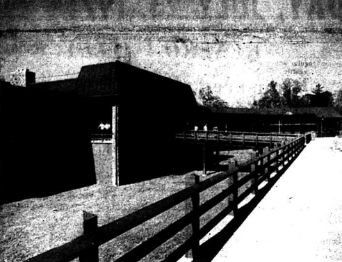
LODGE OPENS—Carter County fieldstone, Norman arches, cedar siding, and a mansard roof are welded together amidst the lush greenery of the Eastern Kentucky mountains in the stately lodge complex at Greenbriar Lake State Resort Park at Greenup. The tri-level lodge, located on Ky-1, 15 miles west of Ashland, opens for public use on Friday, May 28. To the right of the lodge are three levels of luxurious guest rooms. Each of the 36 rooms has individual climate control, a private patio or balcony that overlooks the lake, and each utilizes Kentucky-made furnishings to cater to the traveler's comfort.