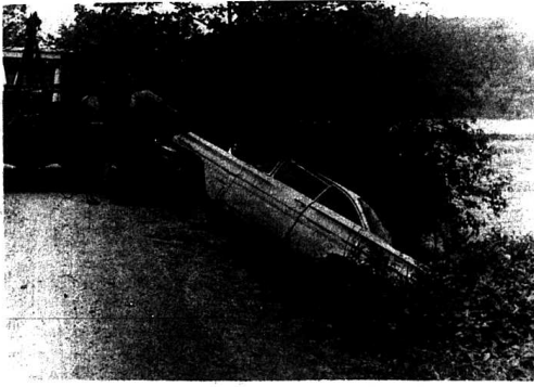
The first of what will probably become more or less routine, accident of it's type happened last Friday night when the above Pontiac went off of Renfro Road and wound up on its top in the edge of Lake Linnville. There were no injuries, and therefore no accident report filed with State Police so we have no details on what happened or who was involved. Just suffice it to say that who ever it was was lucky and that water gets awfully deep out there.