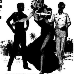
ATTRACTION/PRESENTER: GOLDIE HAWM There's a Girl in My Hoop