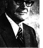
The Thirty-Eight (38th) Annual Meeting of the stockholders of the Cumberland Production Credit Association will be held at the Brodhead 5th grounds, Tuesday, July 27 at 10:30 a.m. You are urged to attend the annual meeting and vote for election of two (2) directors for a three year term. Receive a report of the progress of your association, hear a report of the board of directors and transact any other business that may come before the meeting.

The apartments should ready within approximately sixty days. You may make application every Monday, Wednesday and Friday in the office of the Housing Authority of Mt. Vernon in the Courthouse from 2:30 p.m. to 4:30 p.m.