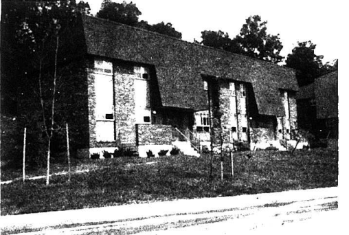
Applications are still being taken for applications in the twenty regular housing units of the Mt. Vernon Municipal Housing Project. The above photo shows one of the apartment houses in the project which is located just off of Town Hill. Application for the apartments may be made each Monday, Wednesday and Friday from 2:30 p.m. to 4:30 p.m. in the office of the Housing Authority of Mt. Vernon, which is located in the Courthouse.