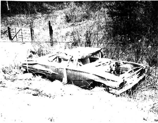
In 1972, we could get rid of all the junk cars, such as the one above, which clutter right-of-ways, lawns, fields, etc. all over Rockcastle County.